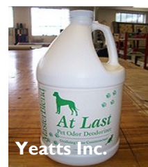
A new solution.

true in all of the water damage cases. Any bad odor from water was eliminated in one day. Of course, we sometimes allowed the machine to operate for an additional day or more depending on the severity of the event in order to kill airborne mold spores or harmful bacteria. The model we use is so effective it can be placed in the contaminated area but yet clean the entire air in an area as large as 70.5 feet by 70.5 feet with a height (ceiling) of 8 feet. Most important for all parties is that the Hydroxyl generator is completely safe. No humans or pets have to vacate any rooms at anytime.