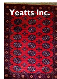
A used rug.

An individual or couple will see a nice wool or synthetic rug at a yard sale or consignment shop and just know that this rug would look perfect in a certain room. Usually very few questions regarding the previous owner of the rug are asked or apparently answered before the transaction takes place. Yeatts Inc. should know because we ask all customers about the condition of any rug we clean. So when we ask individuals who have recently purchased a used rug at a yard sale, estate sale, or shop about the condition; they have no idea. In some cases we instantly point out old yellow stains from urine, coffee, tea, or harsh cleaning agents that the new owner neither noticed or assumed cleaning would remove the yellow areas. We have witnessed individuals complain about a odor in the rug even if no urine stains are present. The odor is really noticeable as they bring these rugs to Yeatts Rug Plant in their vehicles. Of course these are the tufted wool rugs with canvas or other backings affixed with latex. This subject, in more detail, has been on our FAQ page for a decade. Sometimes the rug is so stained that cleaning will only sanitize the rug.